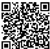
Scan for the full upcoming event schedule

All of these are amazing books so make sure to pick one or two up at the library! Or if you are still not convinced you could always pick up a classic Dr. Seuss book in honor of his birthday.